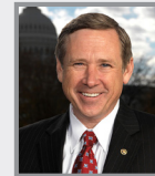
Mark Kirk (R) DID NOT VOTE