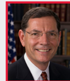
John Barrasso (R) NO