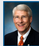
Roger Wicker (R) YES