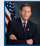
Richard Blumenthal (D) YES

On June 29, 2012, the Senate passed a bill with bipartisan support to keep interest rates on subsidized Stafford loans from doubling.