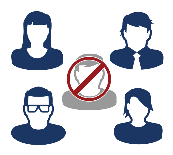
Source: National Immigrant Justice Center, Human Rights First, and Penn State Law "The One-Year Asylum Deadline and the BIA" (2010).

One in five refugees seeking protection in the United States are denied asylum because they missed the one-year filing deadline. The Senate's immigration bill eliminates the one-year filing deadline for asylum seekers.