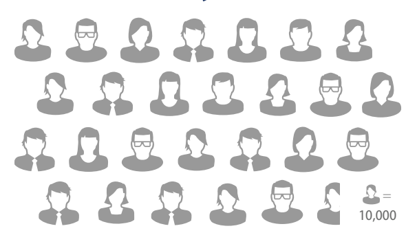
For them, a path to citizenship would mean: